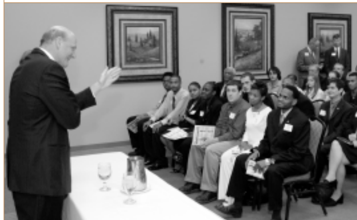
ABOVE: Steve Ballmer answers questions from 80 students at the Student Reception. June 15, 2007