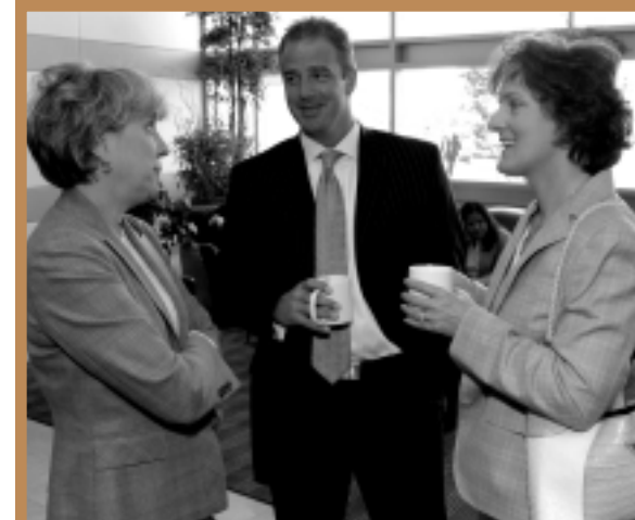
LEFT: Members greet over coffee at the Network Café, prior to the DEC meeting with Steven Ballmer.